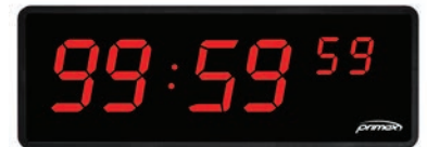
Surface-Mount Timer Kit

* Digital Clock needs to be purchased separately, retrofit existing LEVO clocks