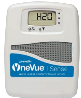
Water Leak and Contact Closure Sensor