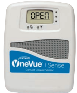
Contact Closure Sensor