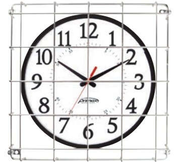
Analog Clock Wire Guard