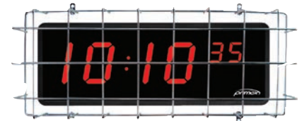
Digital Clock Wire Guard