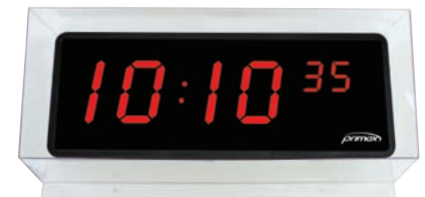
Clear Polycarbonate Digital Clock Guard